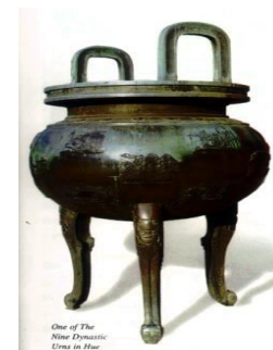
One of The Nine Domestic Urns in Hue

Arrival in Hue, meet with your guide and transfer to visit Hue Citadel - Vietnam's former imperial capital and recognized by UNESCO as a World Heritage site. With an area of 500ha and a system of three circles of ramparts, namely from outside to inside: Kinh Thanh Hue (Hue Capital Citadel), Hoang Thanh (Royal Citadel) and Tu Cam Thanh (Forbidden